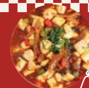
麻婆豆腐 £12.80 Stir-Fried Tofu in Spicy Sauce (Mapo Tofu)