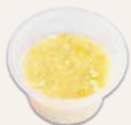
雞蓉粟米湯 £4.50 Chicken Sweet Corn Soup