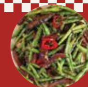
干煸四季豆 £12.80 Stir-Fried String Beans