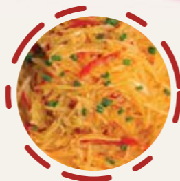
辣爆土豆絲 £9.80 Stir-Fried Shredded Potato with Chilli