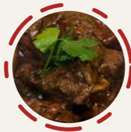
柱候牛腩 £11.80 Stewed Beef Brisket in Chu Hou Sauce