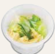
鮮蝦雲吞湯 £5.80 Prawn & Pork Wonton Soup