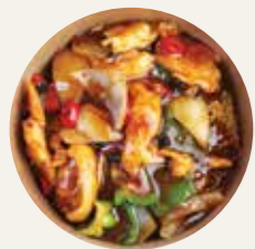
豉椒雞球炒麵 Fried Noodles with Chicken in Black Bean Sauce £11.80 轉牛肉/Change to beef +£1.00 可轉河粉或飯/ Change to Ho-Fun or Rice