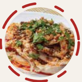
口水雞(凍) £7.80 Chilled Chilli Chicken Slices