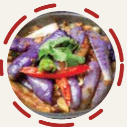
魚香茄子 £12.80 Braised Aubergine with Minced Pork & Salty Fish