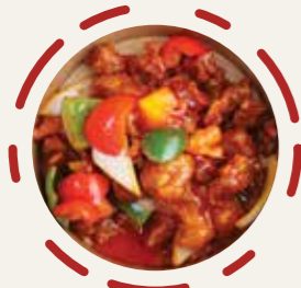
咕嚕肉/雞 £12.80 Sweet & Sour Pork/Chicken

All main dishes are not served with rice unless otherwise stated.