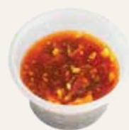
川味酸辣湯 £5.50 Sichuan Hot Sour Soup