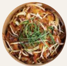
乾炒牛河 Sliced Beef Ho-Fun with Soya Sauce £11.80 可轉米粉/ Change to Rice Vermicelli