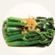
薑汁芥蘭 £13.80 Sautéed Chinese Broccoli with Ginger