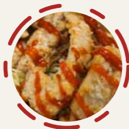
秘製家鄉雞 £11.80 Deep-Fried Chicken