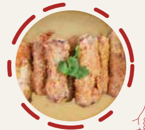
蒜香三寸骨 £13.80 Fried Pork Ribs with Garlic