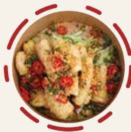
椒鹽鮮魷/蝦 £13.80 Salt & Pepper Squid/Prawn