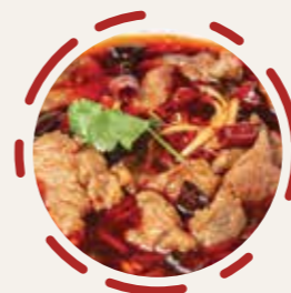
水煮牛肉片 £13.80 Spicy Beef in Hot Chilli Oil