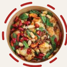
川味霸王雞 £14.80 Sichuan Dried Chilli Chicken