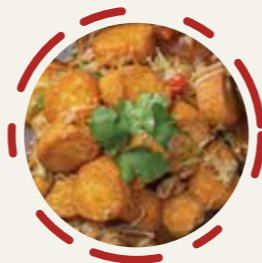
肉鬆玉子豆腐 £13.80 Braised Minced Pork & Egg Tofu