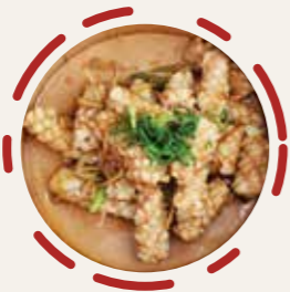
蝦醬炒鮮魷/蝦 £13.80 Stir-Fried Squid/Prawn with Shrimp Paste