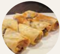
素春卷 (6pcs) £5.80 Vegetarian Spring Roll (6pcs)