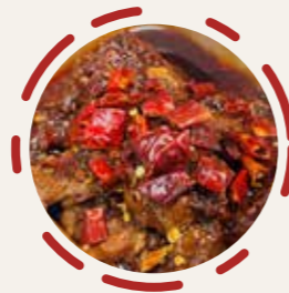
四川牛腩 £12.80 Stewed Beef Brisket in Chilli Sauce