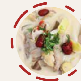
胡椒豬肚雞煲 W/£38.80 Peppercorn Pork Maws and Chicken Hot Pot H/£24.80