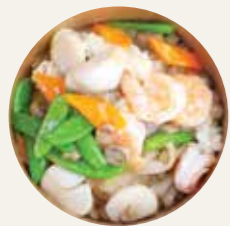
三鮮炒河 Fried Ho-Fun with Mixed Seafood £12.80 可加滑蛋/Add Egg White Sauce 可轉麵或飯/ Change to Noodles or Rice