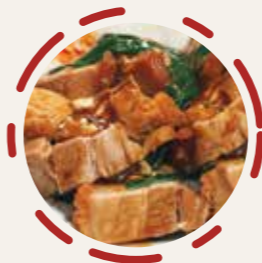
豆腐炆火腩 £13.80 Braised Pork Belly with Tofu