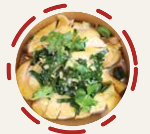
香妃蔥油雞 W/£28.80 Chicken with Ginger & Spring Onion H/£19.80