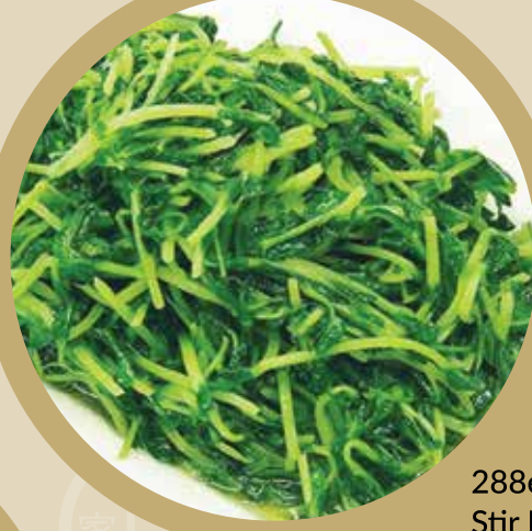
288e 豆苗 Stir Fried Dau Miu £15.80