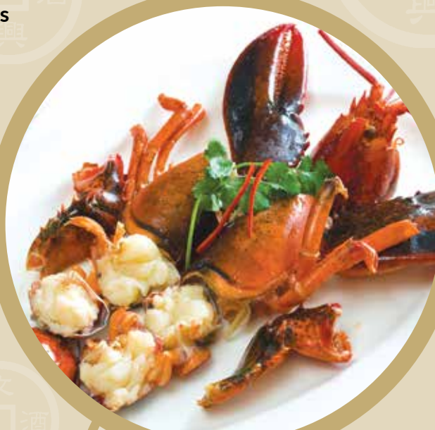
169d 清蒸龍蝦 Steamed Lobster Seasonal Price