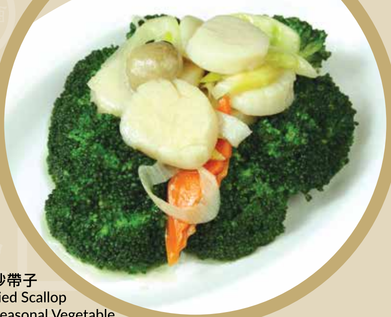
201b 時菜炒帶子 Stir Fried Scallop with Seasonal Vegetable £20.90