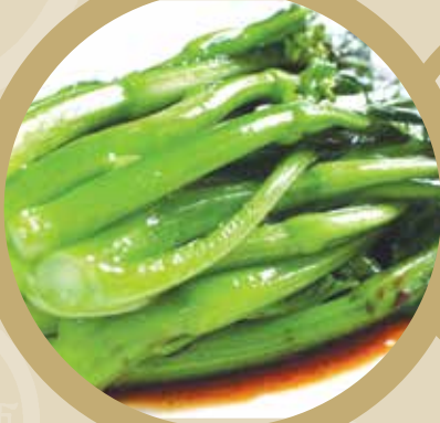
288a 菜心 Stir Fried Choi Sum £13.80