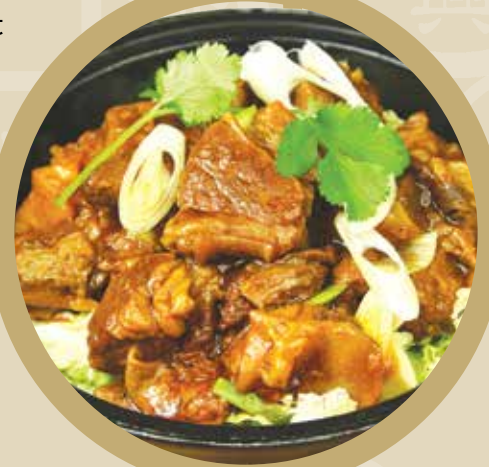
304 燴牛腩煲 Stewed Beef Brisket in Hot Pot £17.80