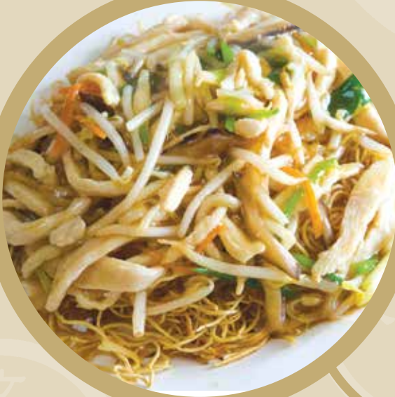
313 雞絲炒麵 Shredded Chicken Fried Noodles £12.80

310 三鮮炒麵 £15.80 Mixed Seafood Fried Noodles