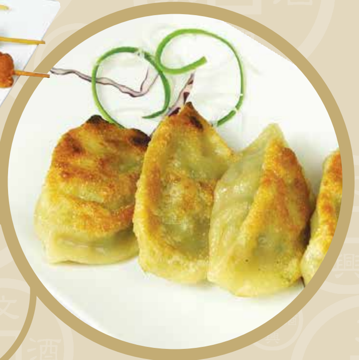
121 生煎鍋貼 (四件) Pan-Fried Peking Dumpling (Portion of 4) £8.80