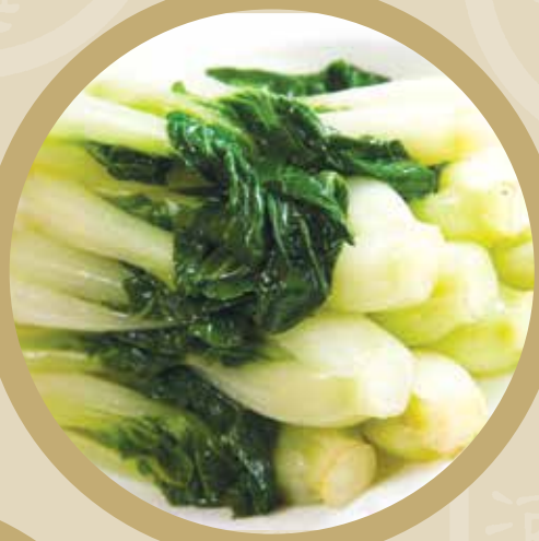
288c 白菜苗 Stir Fried Pak Choi £13.80