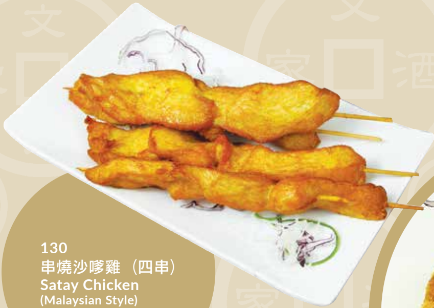
130 串燒沙嗲雞 (四串) Satay Chicken (Malaysian Style) (4 Skewers) £8.80