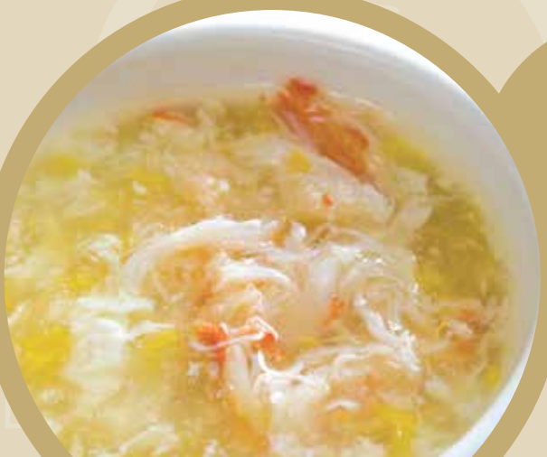
146 蟹肉粟米羹 Crab Meat Sweet Corn Soup £6.50