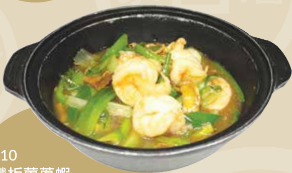
210 鐵板薑蔥蝦 Sizzling King Prawns with Ginger and Spring Onions £16.90