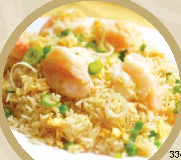
334 蝦球炒飯 King Prawns Fried Rice £14.80