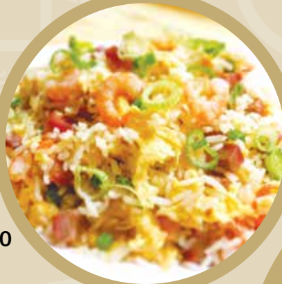
340 蛋炒飯 £5.50 Egg Fried Rice