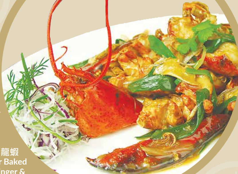
169a 薑蔥焗龍蝦 Lobster Baked with Ginger & Spring Onions Seasonal Price