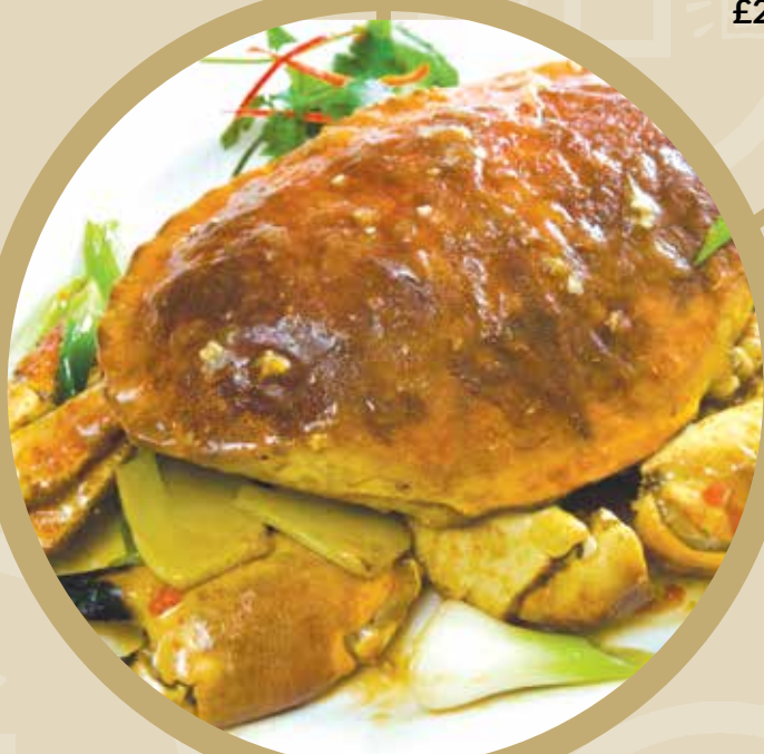
170a 薑蔥焗蟹 Baked Crab with Ginger & Spring Onions £29.80