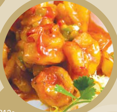
212c 四川蝦球 Sichuan King Prawns 🌶️🌶️ £16.90