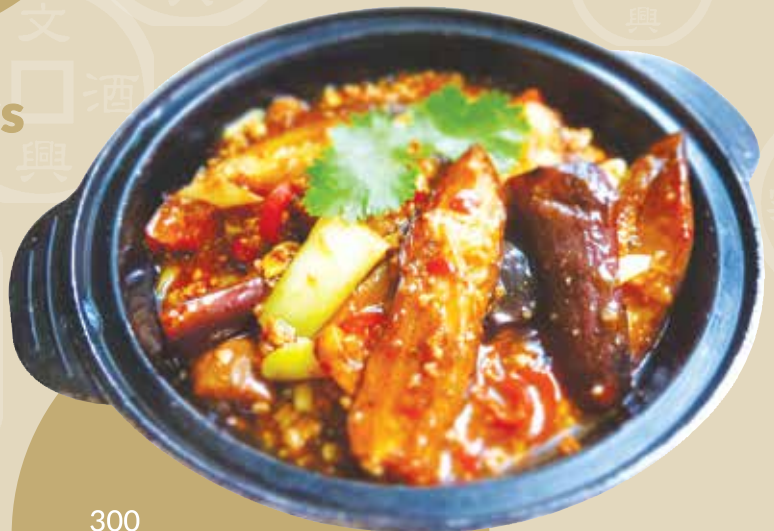
300 魚香茄子煲 Braised Aubergine with Minced Pork in Hot Pot 🌶️ £16.80