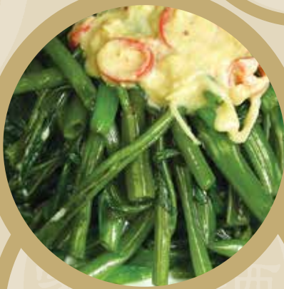
288f 通菜 Stir Fried Morning Glory £13.80