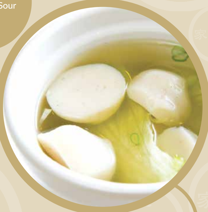
150 魚蛋湯 Fish Ball Soup £6.50