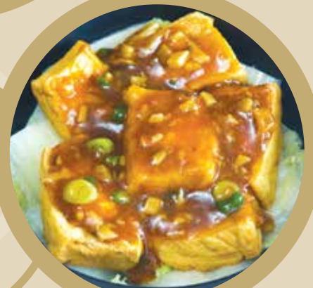
303 釀豆腐煲 Stuffed Beancurd £17.80