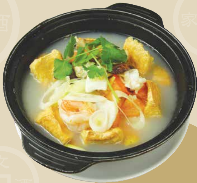
306 東江三鮮釀豆腐煲 Mixed Seafood & Beancurd Hot Pot in Soup £17.80