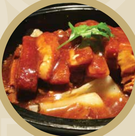
301 梅菜扣肉煲 Double Cooked Belly Pork with Preserved Vegetables in Hot Pot £17.80