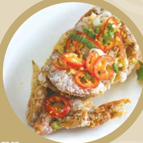
128 椒鹽軟殼蟹 Deep-Fried Soft Shell Crab with Salt & Pepper 每隻 / each £10.80