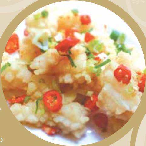
202b 椒鹽鮮魷 Deep Fried Squid with Salt & Pepper 🌶️ £16.90