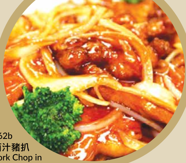
262b 西汁豬扒 Pork Chop in Appetising Sauce £14.80