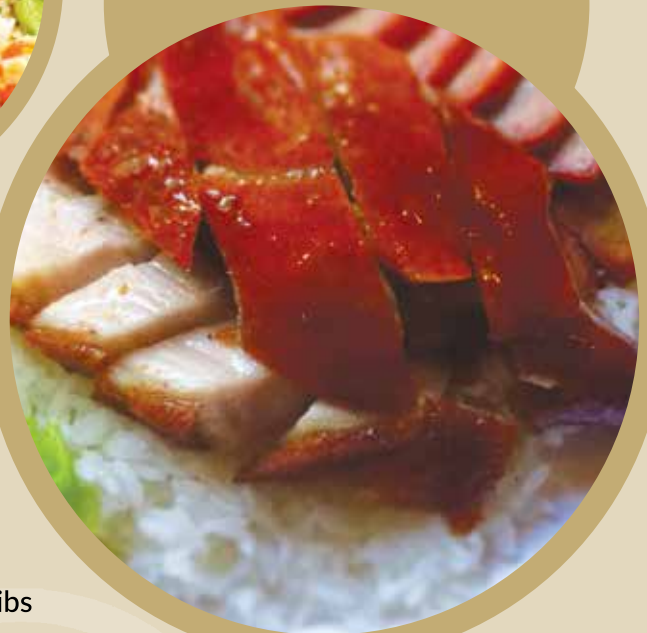
344 三拼燒味飯 3 Combination Barbecued Meat on Rice £15.80