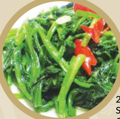
288b 菠菜 Stir Fried Chinese Spinach £13.80